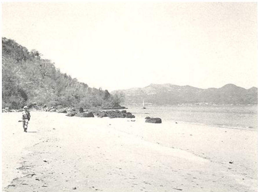
1. BEACH ON TABOQUILLA ISLAND, WITH TABOGA AND ITS VILLAGE IN THE DISTANCE