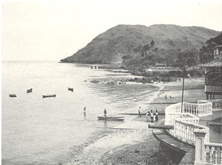
2. HILLS ON THE SOUTHERN END OF TABOGA ISLAND, AS SEEN FROM THE VILLAGE March 16, 1952