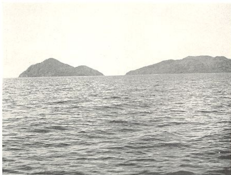
2. URAVÁ ISLAND, AT THE LEFT, AND THE SOUTHERN END OF TABOGA ISLAND