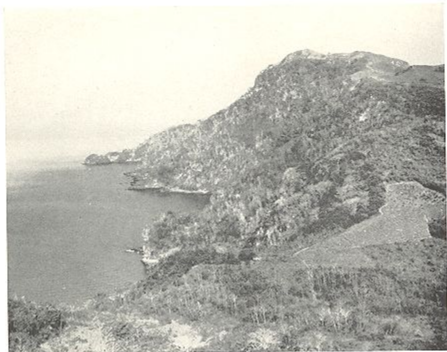
2. THE WESTERN SIDE OF TABOGA ISLAND, SITE OF NESTING COLONIES OF THE BROWN PELICAN