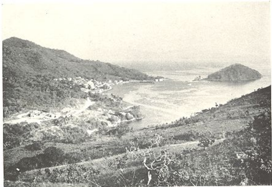
1. THE VILLAGE AND BAY ON TABOGA ISLAND. WITH THE ISLET EL MORRO AT THE RIGHT